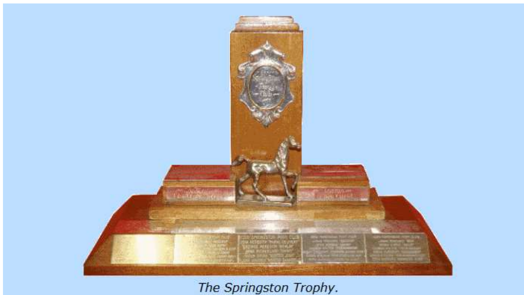
The Springston Trophy.

2pm MOUNTED PRIZE GIVING (Time is approximate and weather dependent)