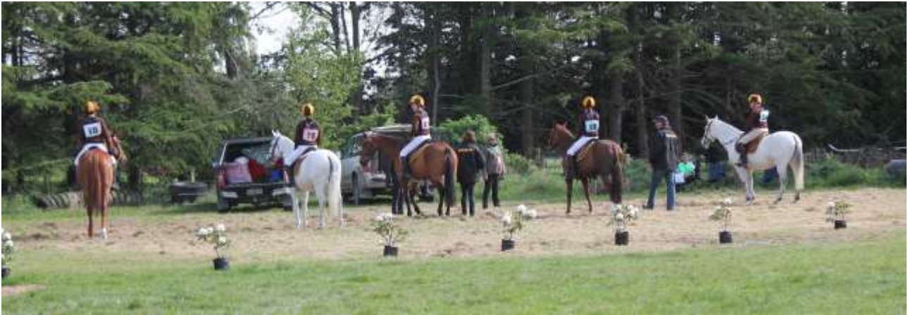
Springston team getting a dressage gear check