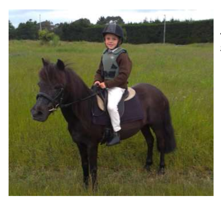
The highlight of my year at Pony Club is getting my D certificate